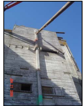
North face of part of the silos